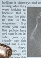
Mystery cloud as seen in Life Magazine May 12, 1963

holding it sideways and not realizing what they were looking at because that is the way the photo was in the magazine. But when you take this picture here and turn it on its side, you can clearly see this shape. It has a certain shape. Nobody got it in enough in the turn this are on its side.